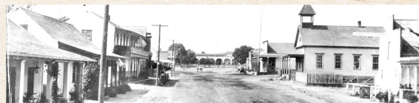
Downtown San Juan Capistrano circa 1910

7 Opened in 1983, designed by Michael Graves. It has been said that the building "speaks the traditional language of the place without using all the same words."