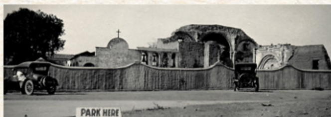
Mission San Juan Capistrano circa 1900s

1 Mission San Juan Capistrano (circa 1776) Mission San Juan Capistrano was founded in 1776 by Saint Serra. As the seventh of the 21 California missions, and the only Mission in Orange County, it hosts the State's most historically significant chapel, Serra Chapel (1782) and the ruins of the Great Stone Church (1806-1812). The mission welcomes people from all over the world as a place of inspiration and education. Mass is celebrated daily.