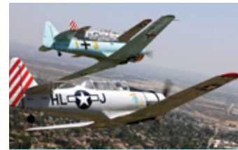
WWII AT-6 Airplanes

By WWII AT-6 Airplanes ( weather permitting )